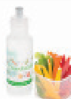
6. Crunch&Sip® vegetables or fruit and a water bottle