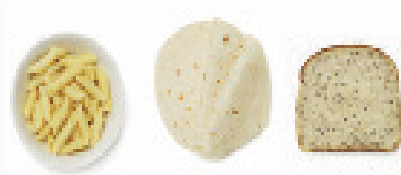
3. Bread & Cereals wholegrain or multi