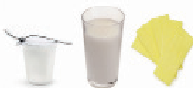
4. Dairy rich in calcium reduced fat milk, yoghurt, cheese or alternatives