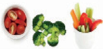
1. Vegetables as snacks or as a filling

For a healthy lunchbox pick an item from each of the key groups: